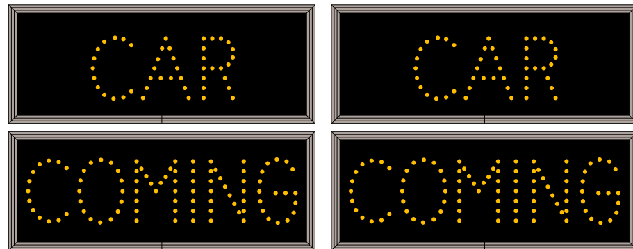
Sample Display Options